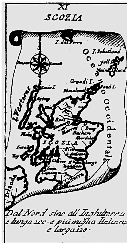
The British Museum

Some time later, a close copy of the pack was published. The titles on these new plates lack the cartouches of the earlier ones and the position of the maps is slightly higher (see Scozia above). A complete example of the first set made £11,875 at Sotheby's London sale-rooms in November 2013.